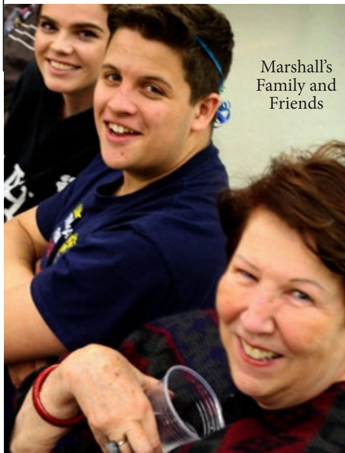
Marshall's Family and Friends

Pine candles and needle plucking can begin now for directional branch growth and ramification and needle reduction; but done under the guidance of an experienced bonsai artist.