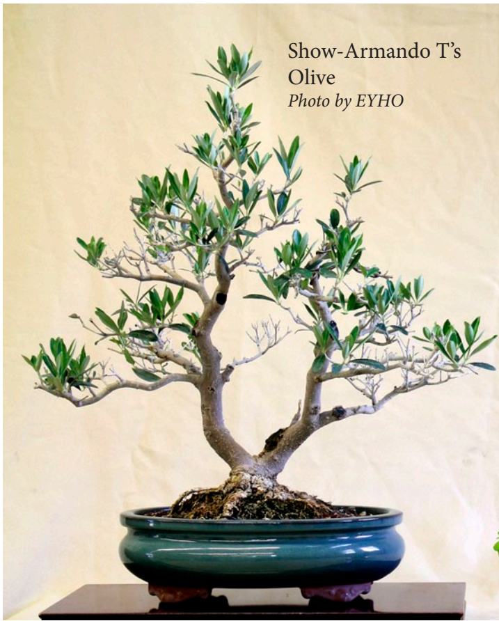
Show-Armando T's Olive